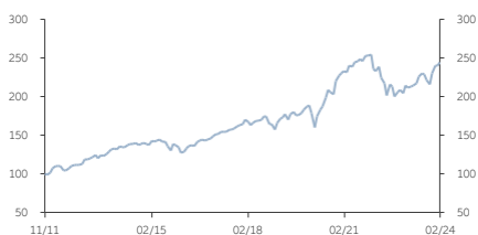
■ Class AT (USD) Acc.